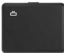
VEGAN FULL BLACK LEATHER